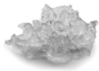
MF 36 Flake ice Residual water content 25%